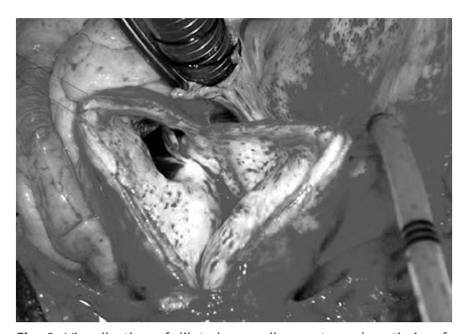
Fig. 2. Visualization of dilated ascending aorta and aortic insufficiency during dissection of the cardiac structures prior to the operative procedure

Surgery for TA should be deferred in the active phase of the disease as surgical interventions are associated with more bleeding, friable tissue and a high risk of thrombosis [1, 3, 4]. In our present case, the surgical procedure was successful without complications as the patient was well maintained on appropriate medical treatment before and during surgery. As the evaluation of the angiographic studies showed involvement of abdominal and renal arteries, TA can be classified as type III. For this reason, she was followed for deterioration in gastrointestinal and kidney functions after surgery for a week in hospital and during the next six months of the follow-up period. Surgical treat-